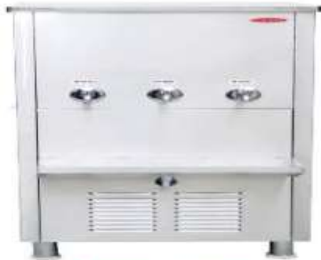
MODEL : CA / CB NORMAL WATER CABINET WITH R.O. SPACE