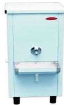
Water Cooler (20 Ltr.)