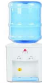
Water Dispenser (Standard Brand)