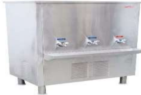
MODEL : HCWA / HCWB HOT + COLD WITHOUT R.O. SPACE