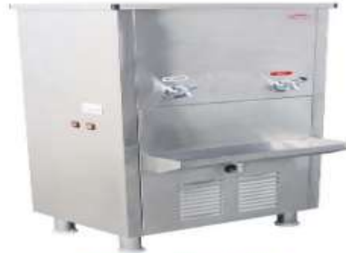
MODEL : NHA / NHB NORMAL + HOT WITH R.O. SPACE