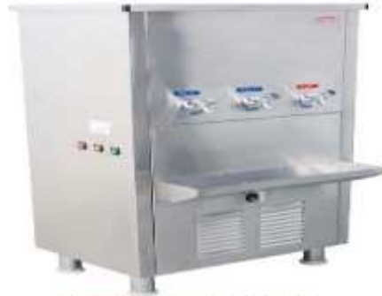
MODEL : HCSA / HCSB HOT + COLD WITH R.O. SPACE