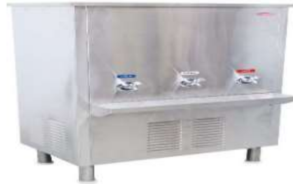
MODEL : HWA / HWB HOT + COLD + NORMAL WITHOUT R.O. SPACE