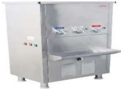
MODEL : HSA / HSB HOT + COLD + NORMAL WITH R.O. SPACE