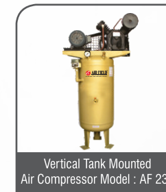
Vertical Tank Mounted Air Compressor Model : AF 239