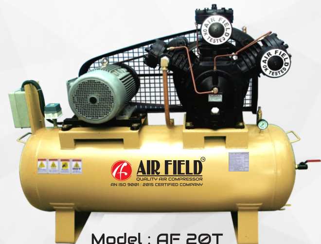
Model : AF 20T