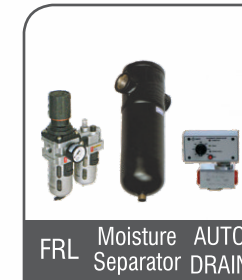
FRL Moisture Separator AUTO DRAIN