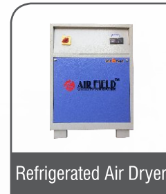
Refrigerated Air Dryer

Dairies, Spray painting units, Air jet cleaning, Agriculture, Textile industries, plastic processing units, 2-wheeler Garages, Scrubber manufacturing units, food industries etc.