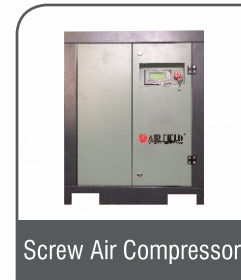
Screw Air Compressor