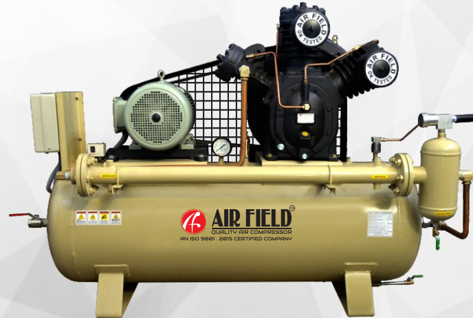
Model : 20 TH Air Cooled