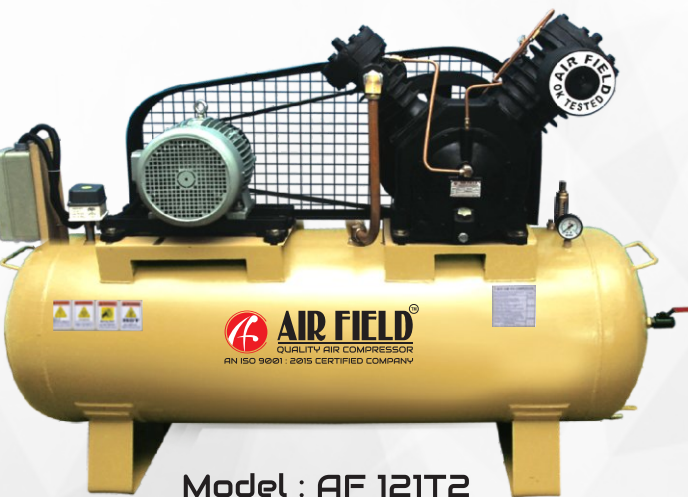
Model : AF 12T2

09925387272, 09030097272 www.maskcommunications.com