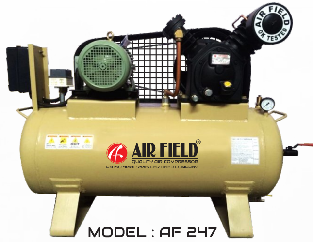
MODEL : AF 247