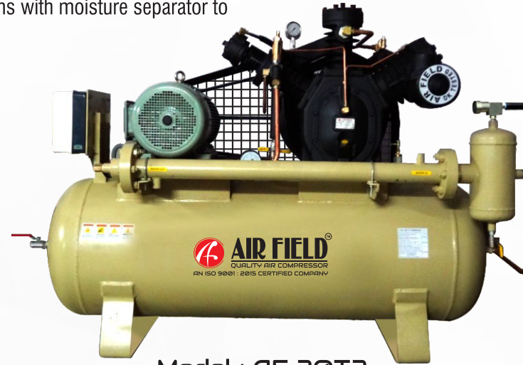
Model : AF 20T2