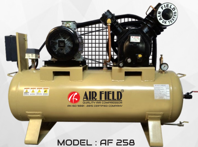
MODEL : AF 258