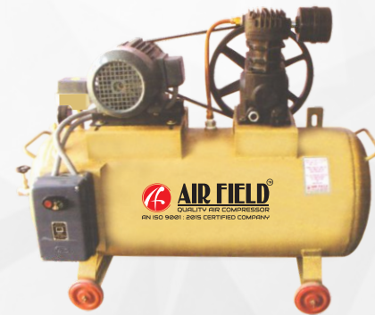
Model : AF S2