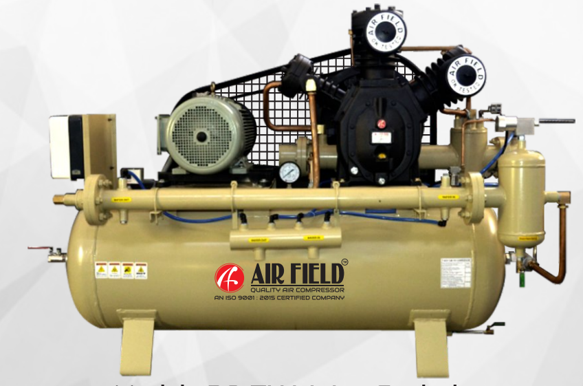
Model : 20 TH Water Cooled