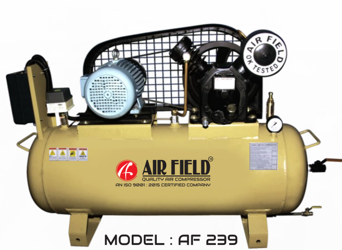
MODEL : AF 239