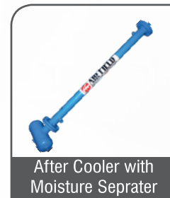
After Cooler with Moisture Separator