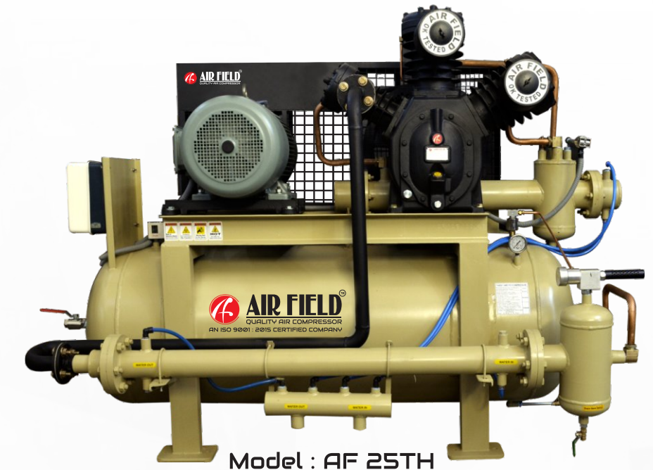
Model : AF 25TH