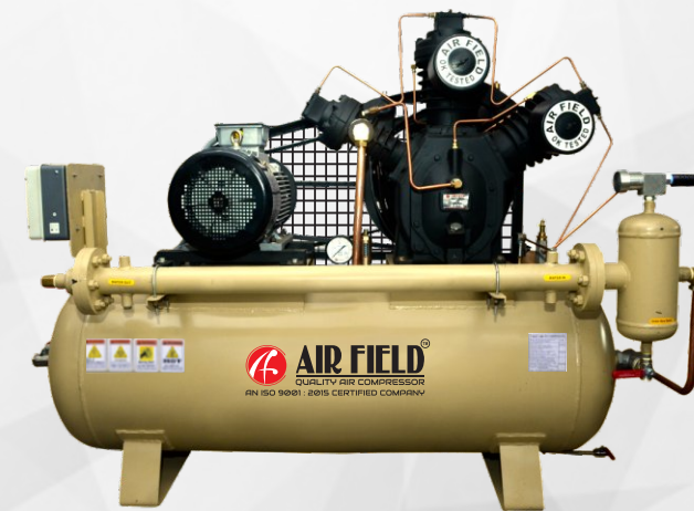
Model : 20 TH Air Cooled with CSC

PET bottling machineries, Blow molding machineries, Gas and transmission, Air operated circuit breakers, Shipyards, Oil Exploration units, Pharmaceuticals, Pneumatic equipment testing, Pneumatically operated air braking systems etc.