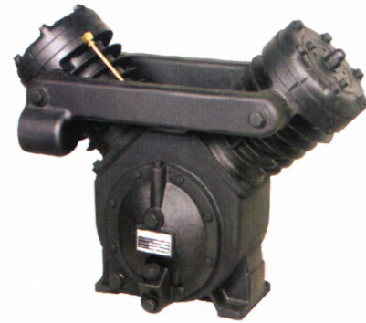
Model : AF 12V

MFRS & EXPORTER OF AIR COMPRESSOR SALES, SPARES & SERVICE