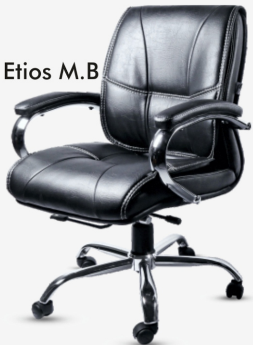
● Etios M.B