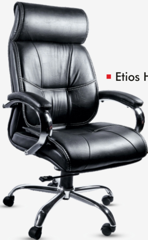
■ Etios H.B