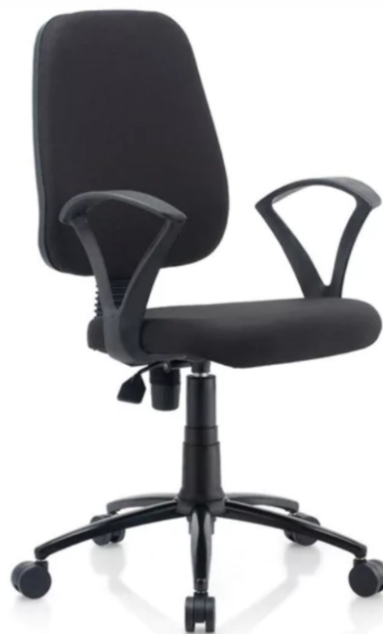
■ W.S 12