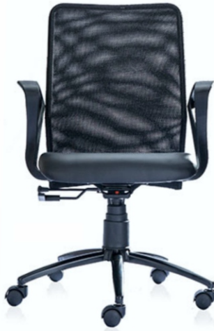
■ W.S 06