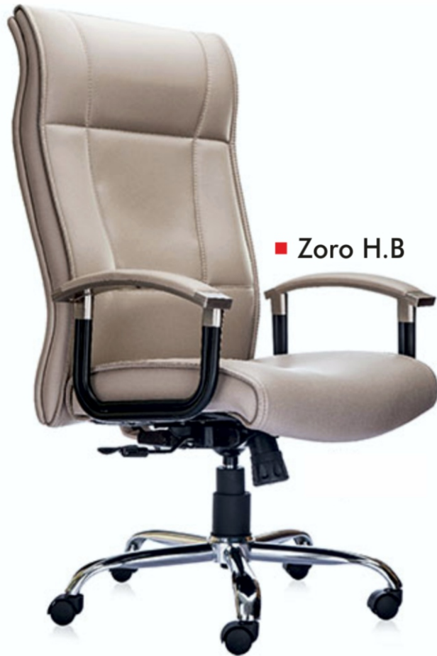
■ Zoro H.B