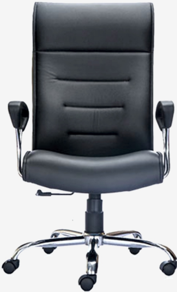
■ Otiva H.B