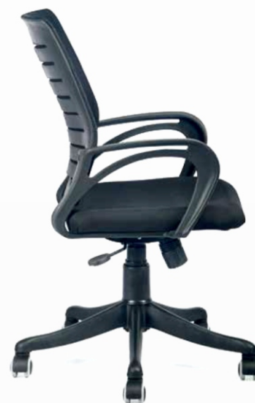
■ W.S 02