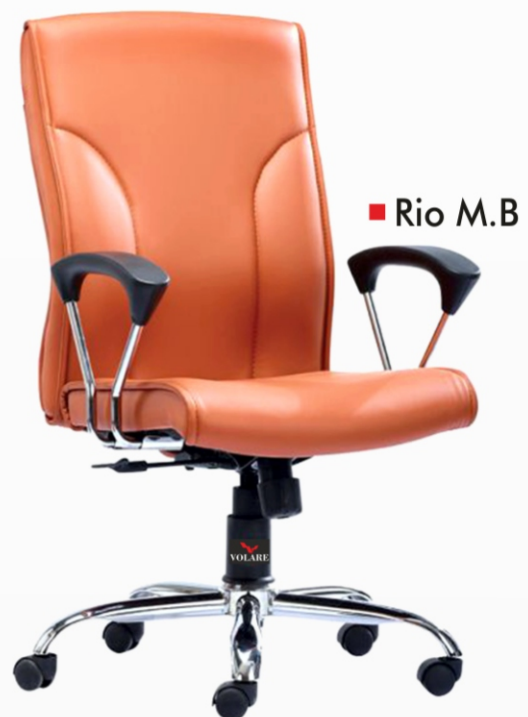
■ Rio M.B