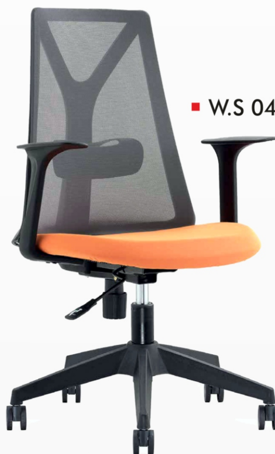
■ W.S 04