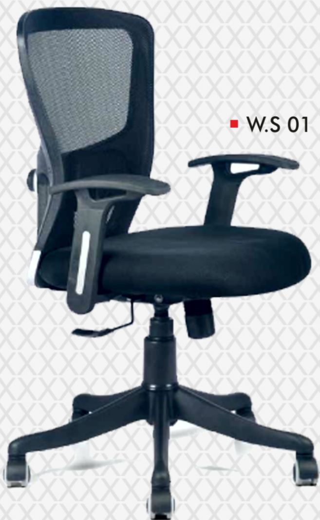
■ W.S 01