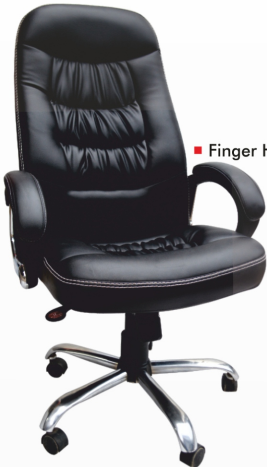
■ Finger H.B