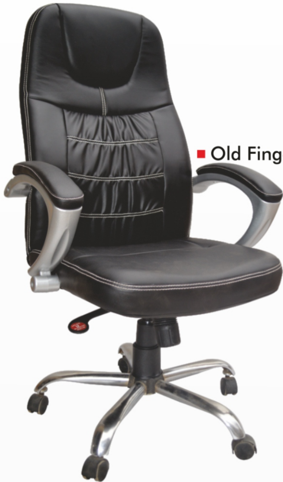
■ Old Finger H.B