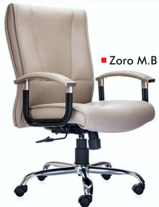
■ Zoro M.B