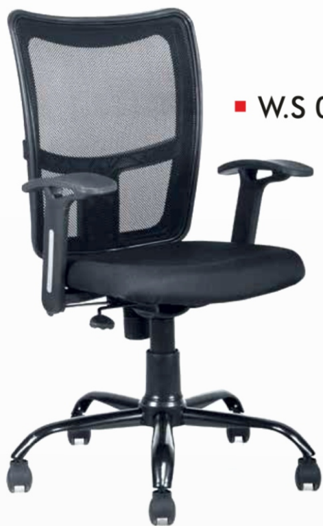
■ W.S 03