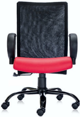
■ W.S 05