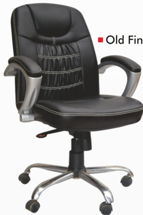
■ Old Finger M.B