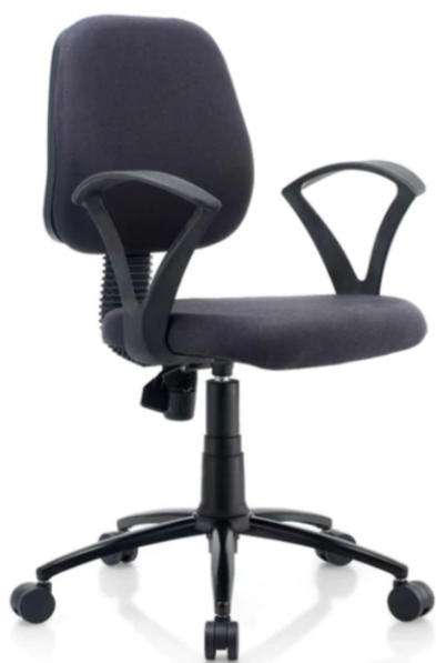
■ W.S 11