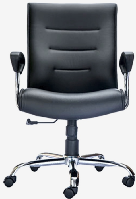
■ Otiva M.B