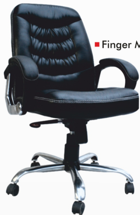
■ Finger M.B