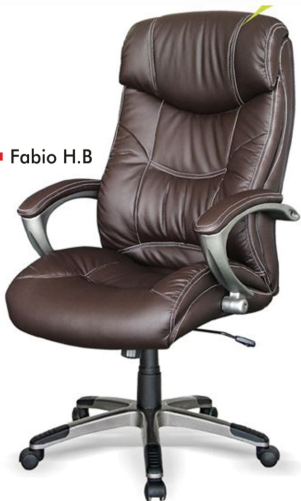
■ Fabio H.B

Tilting Mechanism | Arms with Cushion Pad anti topple chrome polished base Class - 3 gas lift for seat height adjustment & 30% glass filled nylon castors for smooth movement of chair | Upholstery option available in leather 40 dc cushion | 15mm Hot Pressed Ply