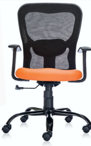
■ W.S 09