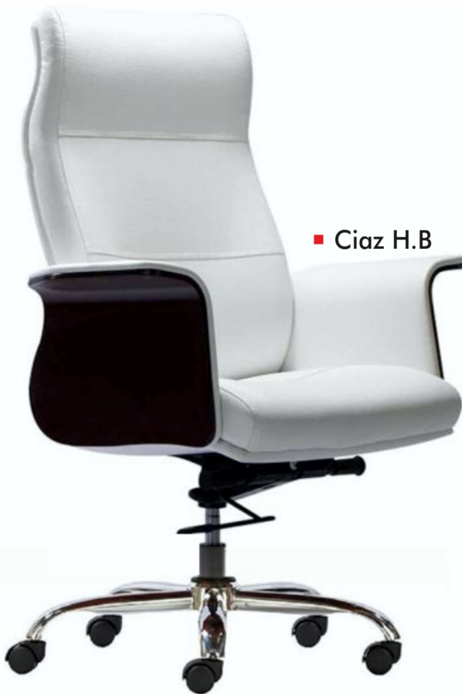
■ Ciaz H.B