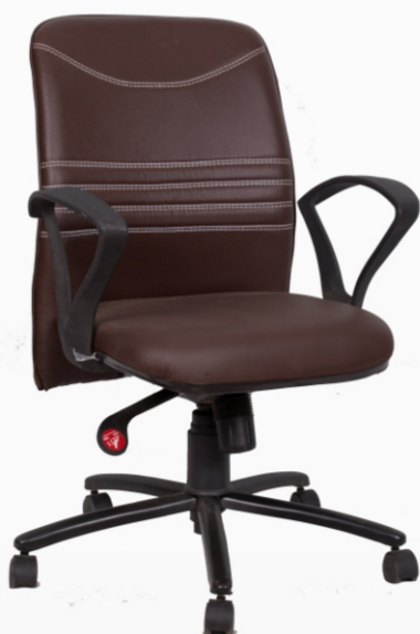
■ W.S 13