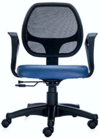
■ W.S 07