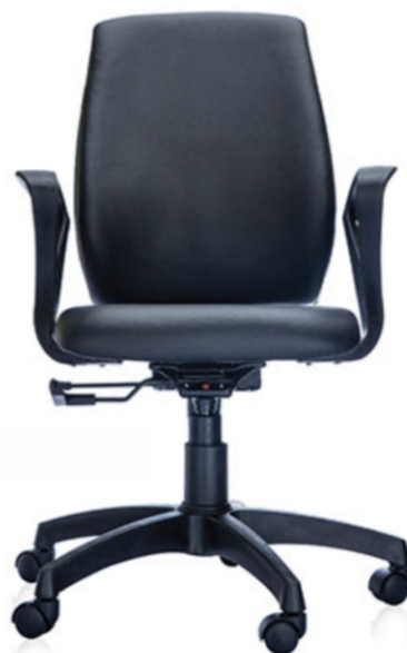
■ W.S 14