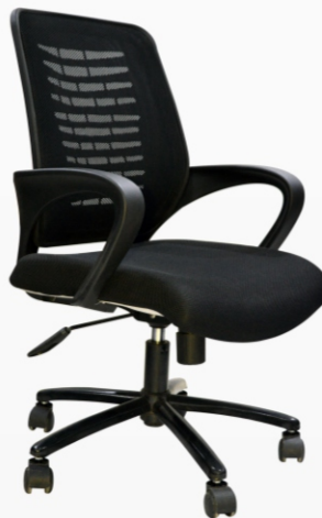
■ W.S 10