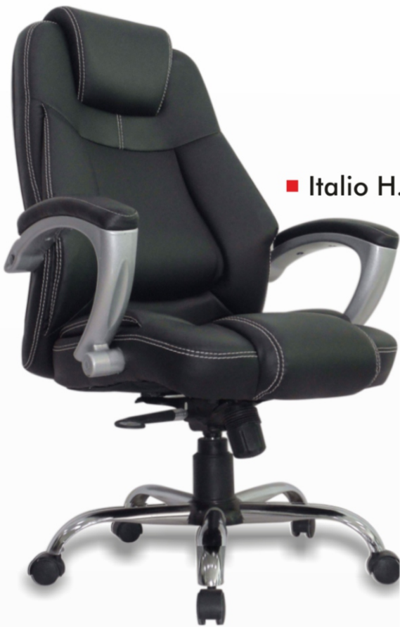
■ Italio H.B