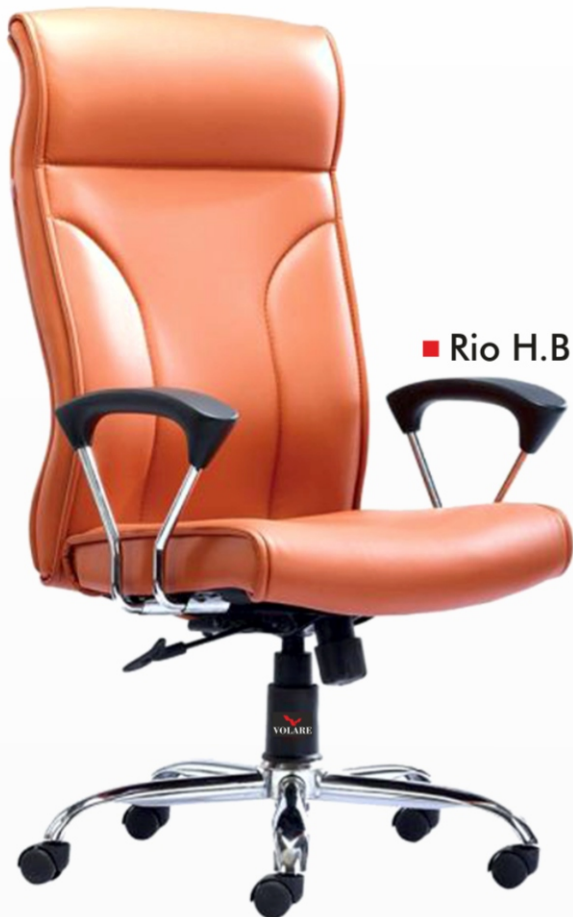
■ Rio H.B