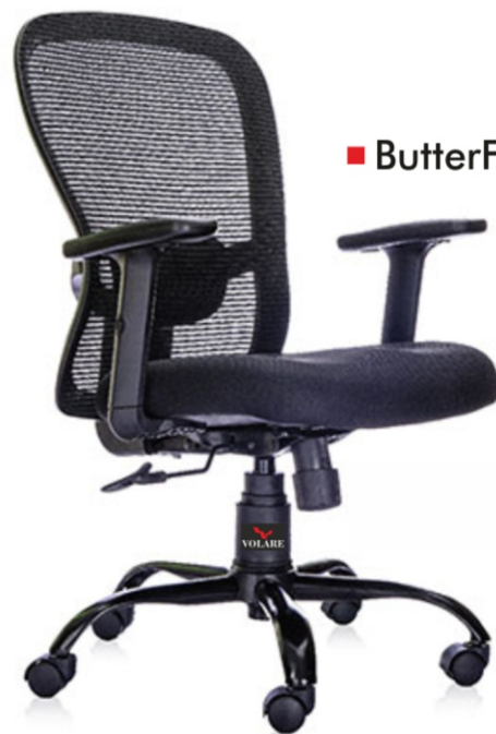
■ ButterFly M.B