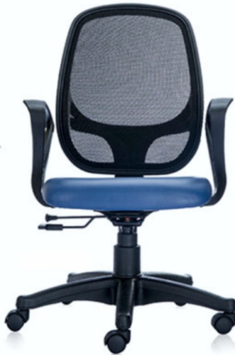
■ W.S 08