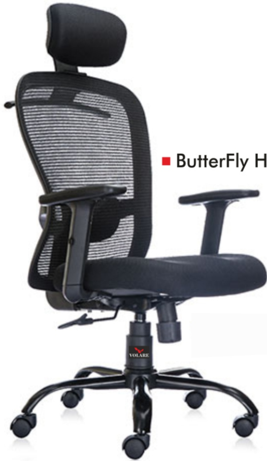
■ ButterFly H.B